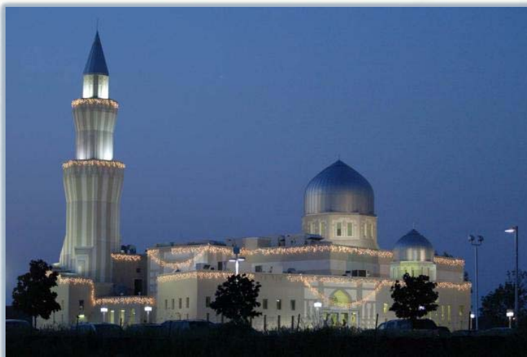
A beautiful night view of Baitul Islām Mosque

Ahmadi Muslims who lived in Toronto prior to the 1990s will remember all of Toronto being just one Jamā'at. Many Ahmadi Muslim children from across Toronto gathered together for their Nāsirāt and Atfal classes at Driftwood School in North York. All members of the Jamā'at congregated at the David and Mary Thomson Collegiate Institute in Scarborough for Ramadan, Jalsas and Majlis Shūrā. We celebrated Eid and other events at Paradise Banquet Hall in Vaughan.