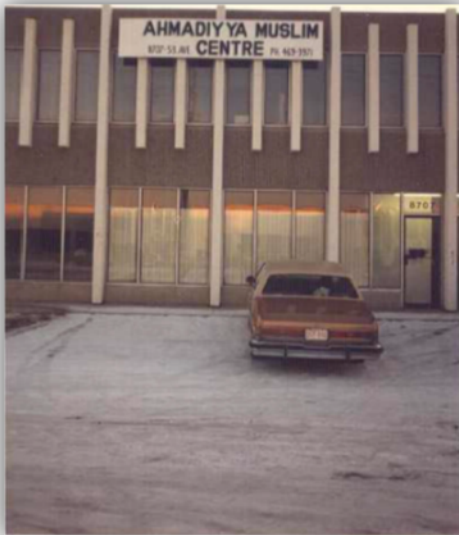
First Ahmadiyya Center Edmonton Jamā'at (February 1984-April 1997)

With the establishment of the Jamā'at and auxiliary organizations, Ta'lim and Tarbiyat activities including Nāsirāt and Atfal classes were initiated. These classes were held at East Glen School and Harry Ainlay Composite High School for 3 years.