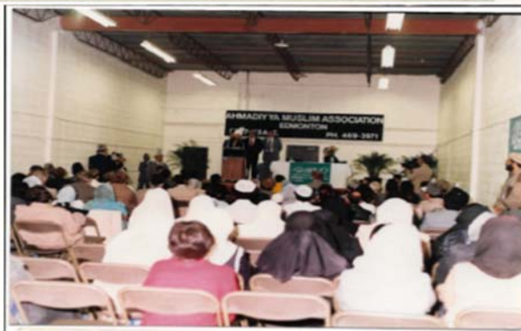
Hazrat Khalifatul-Masih IV delivering a lecture on "Future of Mankind" (1986 at Ahmadiyya Centre Edmonton)

Hazrat Khalifatul-Masih IV th delivering lecture on "Future of Mankind" (1986 at Ahmadiyya Centre Edmonton)