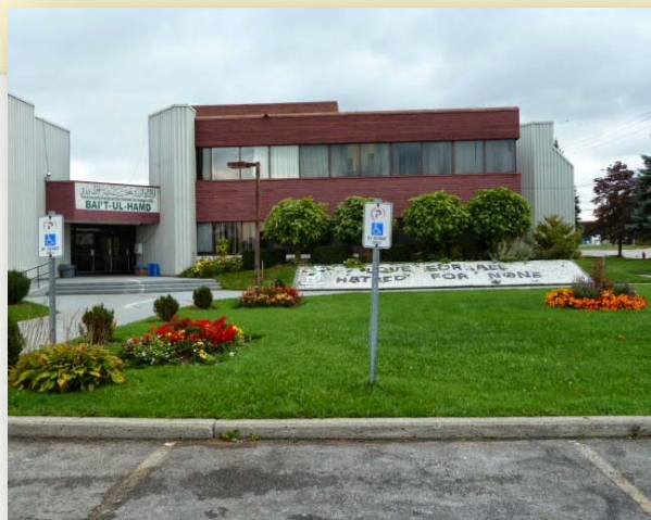
Baitul Hamd Mosque